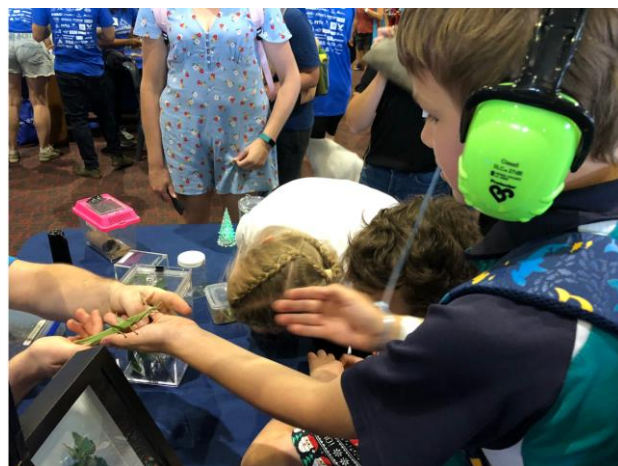
Day 1 2020

P&C Meeting & AGM – Friday 21 st February